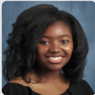
Cathalene Barlow Early College